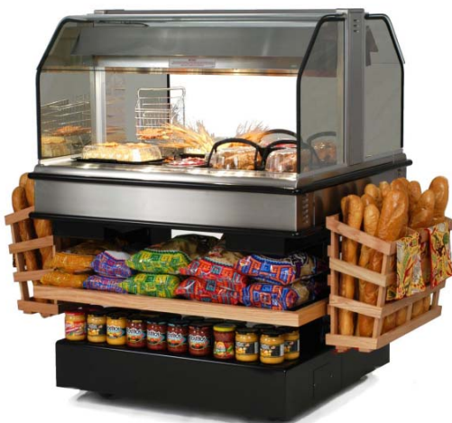
HMI-103 three-well heated island merchandiser, shown on ITB-103 island tiered base sold separately.